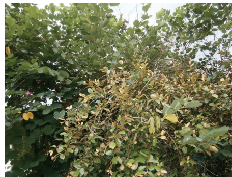
FIGURE 1: Mistletoe on host tree.

The anticancer effect of ML-I depends on activities exerted by both the A-chain and the B-chain. Carbohydrates are bound to the B-chain which mediates the cellular uptake of the hololectin. Cytotoxic A-chain inhibits the elongation step of protein biosynthesis by catalysing hydrolysis of the N-glycosidic bond at adenine-4324 in the 28S RNA of the 60S subunit of ribosomes, resulting in apoptosis or necrosis cell death [36, 37]. The immunomodulatory activity of mistletoe